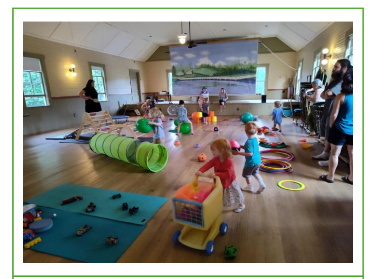
A Fun Preschool Play Date in August

From the June 8<sup>th</sup> Opening Potluck Dinner to Treat or Treat on Halloween, the Old Town Hall had a full and exciting season. The Events Committee (see names of committee members on page 4) worked hard to plan, set up and host events endeavoring to have "something for everyone."